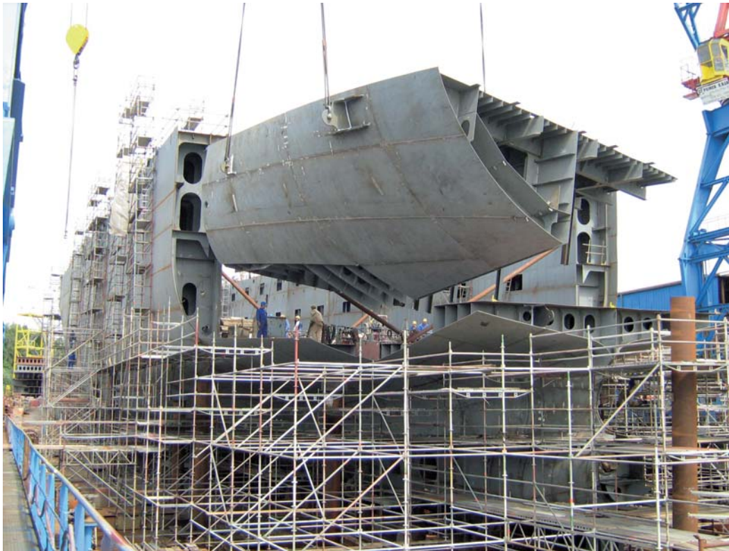
Mounting of a ship section.

Images suitable for printing available at www.enercon.de .