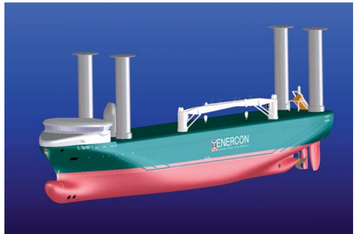
Artist's view of the "E-Ship 1".

The newbuilding at the Lindenau Shipyard in Kiel.